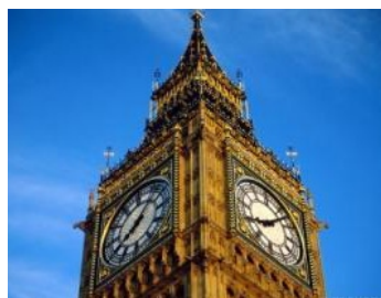
British Isles & Ireland