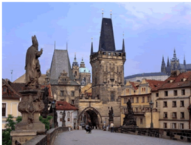
Prague / Vienna