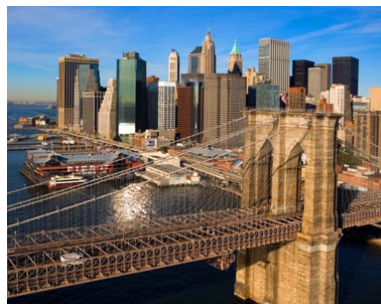
New York City